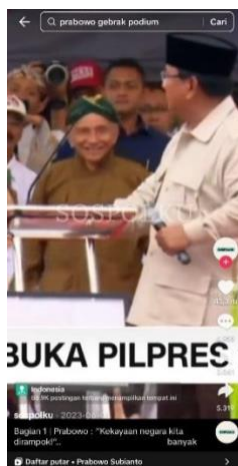
Figure 4. Prabowo's Angry Expression