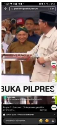
Figure 1. Prabowo's Angry Expression