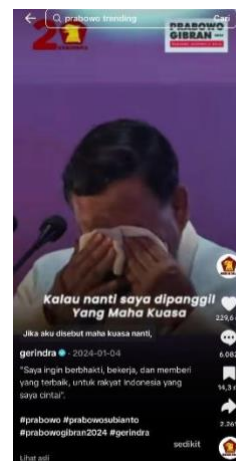
Figure 4. Prabowo Subianto Crying During His Speech

The framing of Prabowo's expression of anger in the 2019 campaign is not merely a reflection of his personal temperament, but rather the result of a well-calculated political communication strategy. The anger displayed through firm gestures, and a high-pitched tone was framed to build the image