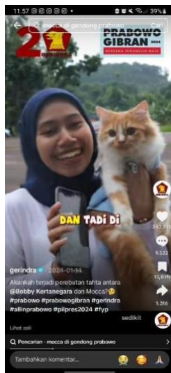
Figure 6. Moka the Cat