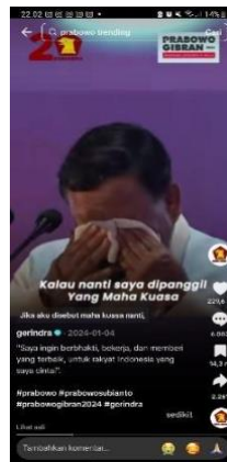
Figure 2. Prabowo Subianto Crying During His Speech