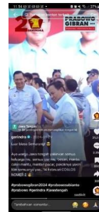
Figure 3. Prabowo Subianto Dancing During the 2024 Campaign